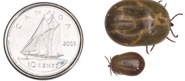
Top to bottom: engorged female dog tick, engorged female black legged tick