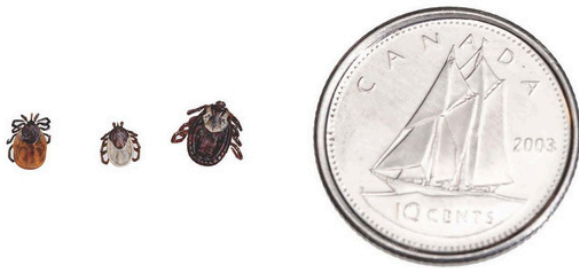
Left to right: Female black legged tick, groundhog tick, dog tick

Ticks are commonly found in tall grass, bushes, wooded areas, urban parks and gardens. There are simple precautions you can take while spending time outdoors.