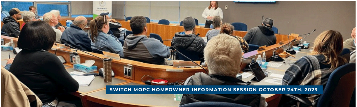
SWITCH MOPC HOMEOWNER INFORMATION SESSION OCTOBER 24TH, 2023