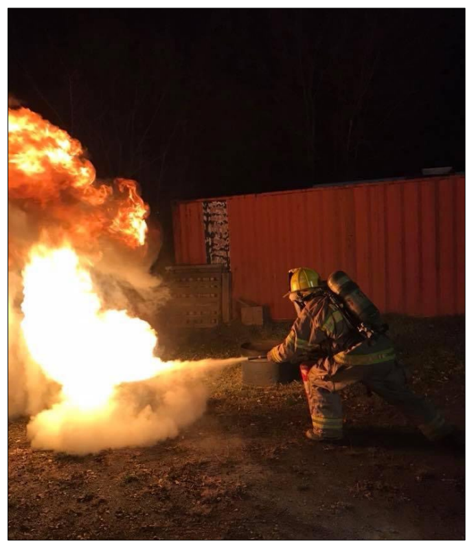
Earn a High School Credit for being part of a local fire station

Once again a Fire Cadet program being offered by some of our counties fire departments. This means that if you are a student in Pictou County in grades 10 through 12, you can sign up for our fire cadet program, and after completing the required curriculum, you will be given a Personal Development Credit that is offered by the Province of Nova Scotia.