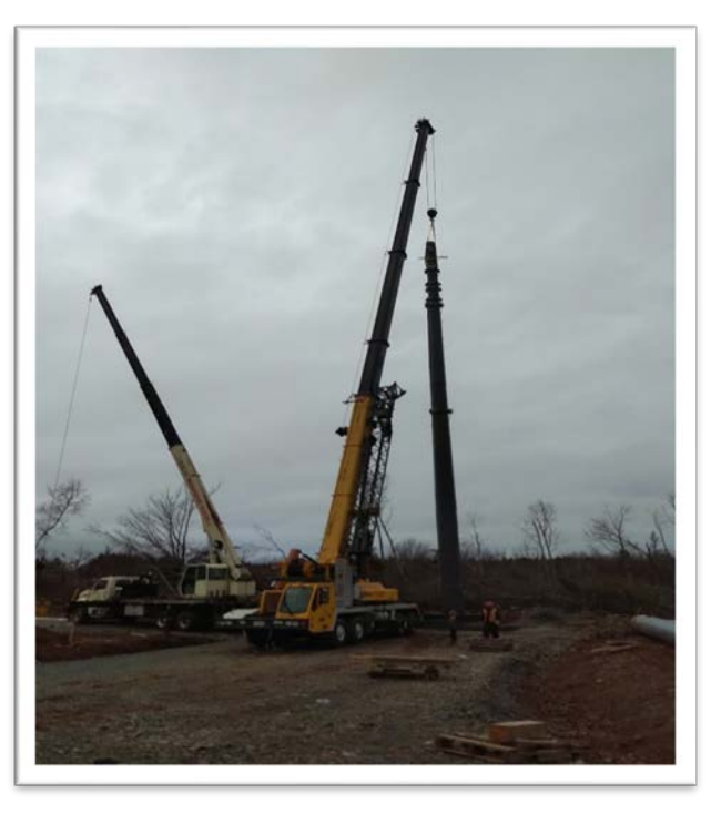
Work on the River John Tower progresses in 2023.

Check out our New Facebook Page: MOPC FirstHome for updates! Community meetings about our wireless service will be published on the site.