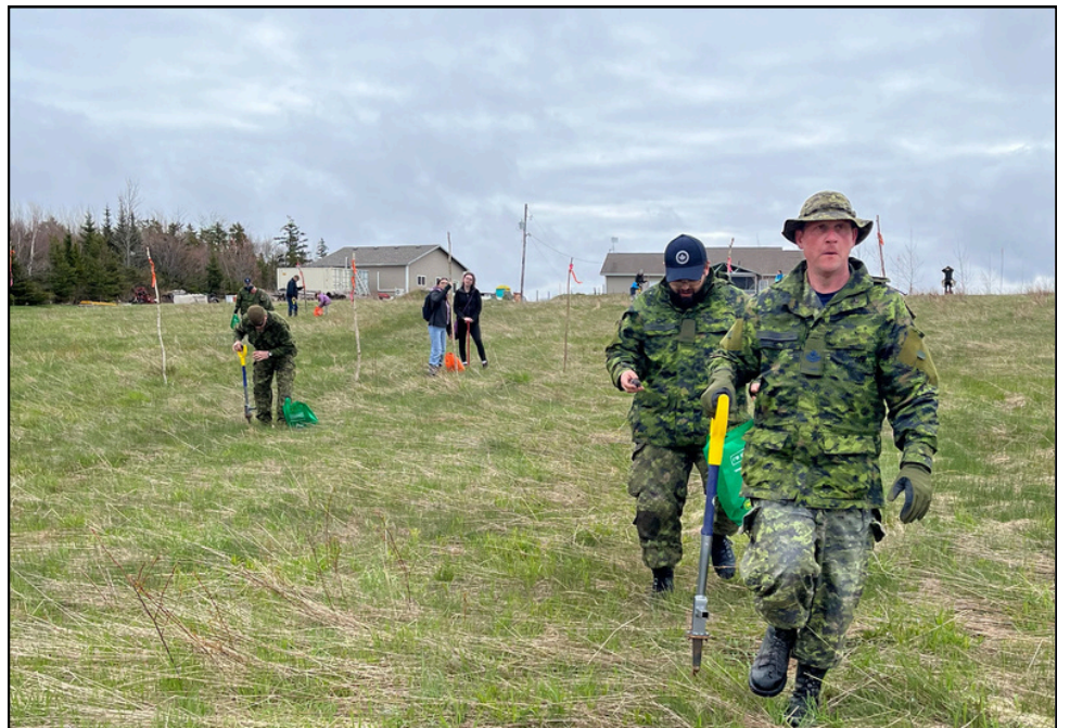
The 144 Construction Engineering Flight in Pictou helped with the tree planting in Merigomish.