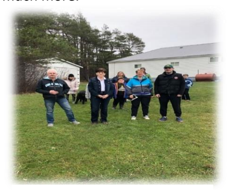
District 1's 10th Annual Fitness Challenge took place in Lismore again this year.

MOPC Recreation helped with a fun day at Trenton Park that allowed newcomers and friends enjoy the recent snowfall. The event included snowshoeing, sledding, cross-country skiing and much more.