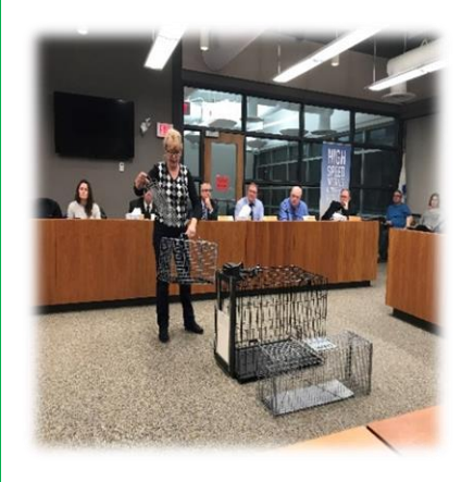
CARMA makes a difference in the local feral cat population