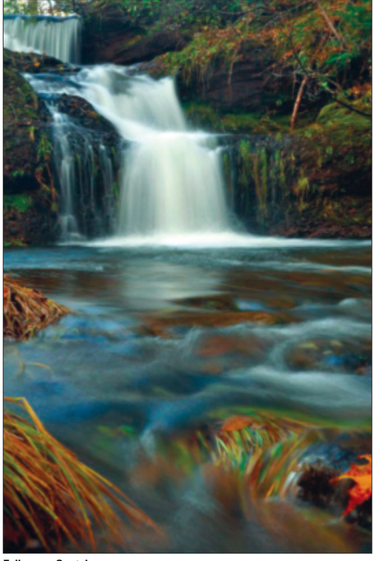
Falls near Scotsburn